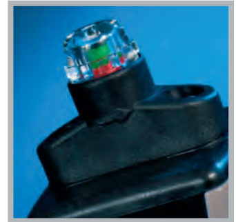
Pop up differential pressure indicator