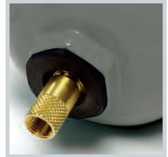
Automatic drain with manual override