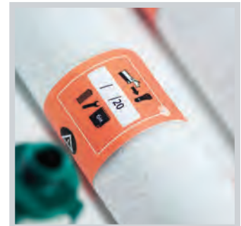
Element replacement reminder label