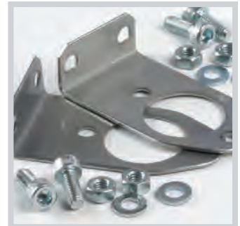
A variety of filter mounting accessories