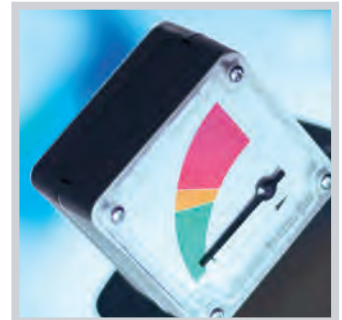
Dual sided differential pressure gauge