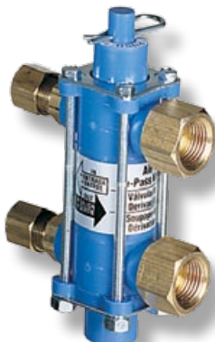
Air Bypass Valve