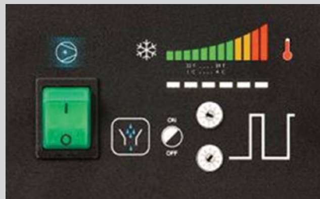
Controls: Models 200-500 scfm