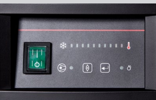
Controls: Models 200-500 scfm