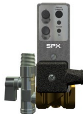
Adjustable Timed Electric Drain