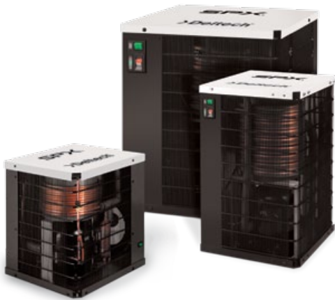
Efficient Smooth Copper Heat Exchangers

Customers around the world have relied on Deltech for great value in air treatment solutions. Deltech Value Line Refrigerated Dryers offer a simple solution based on a long history of industry leading technology.