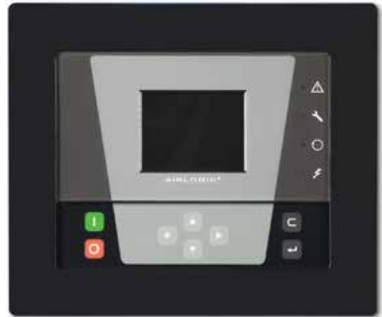
QED 250-2100 controller shown